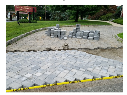
The porte cochere gets a new apron of pavers in a cool design.