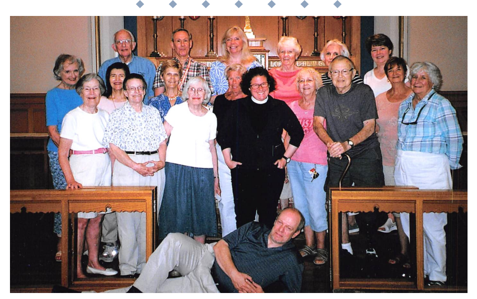
Our 2019 Office Angel Crew!