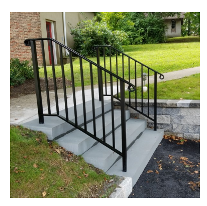
A new retaining wall and bluestone steps have replaced the old railroad tie construction, and new railings have been installed.