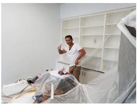
The Priest Associate's office is painted a light blue.